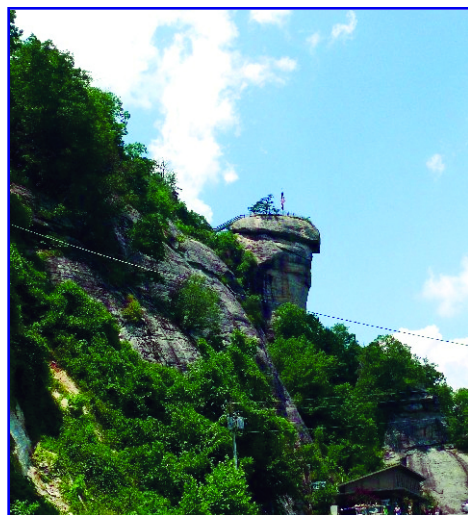
Chimney Rock from upper parking lot.

dream had come true," she said. The people who supported and encouraged her to follow her dream were the inn's first guests.